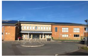
Millennium Centre in Leasowe

The Stein Centre is the venue for outpatient clinics in Wirral. The Millennium Centre is a staff base only with meeting rooms. Both bases have disabled access. There is car parking for visitors to The Stein Centre and The Millennium Centre.