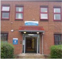
The Stein Centre in Birkenhead