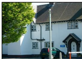
Eastway in Chester

The West Cheshire Community Team have 2 bases: