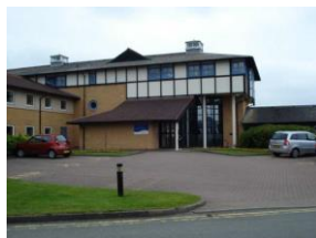
Wyvern House in Winsford

Eastway is the venue for outpatient clinics in Chester. Wyvern House is a staff base only and outpatient clinics are held at Vale House in Winsford. Both clinics have disabled access.