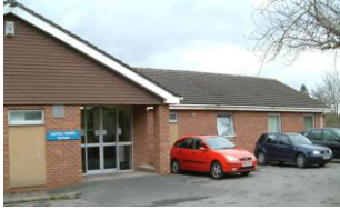
Rosemount Lodge in Macclesfield

The East Cheshire Community Team have 2 bases: